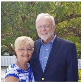
From the Pastor's Desk: The Cross Was His Own

They borrowed a bed to lay His head When Christ the Lord came down; They borrowed the ass in the mountain pass For Him to ride to town. But the Crown that He wore and the Cross that He bore Were His own... The Cross was His own.